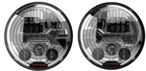
HEATED RIGHT HAND HEADLIGHT