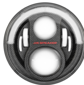
DUAL BURN™ HIGH BEAM