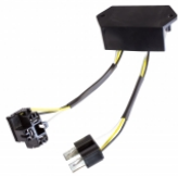
Part Number 8000381 H4/H4 Anti-Flicker Harness for J.W. Speaker LED headlights