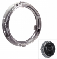
Part Number 3156351 Mounting Ring Kit for 7" Round (PAR56) Headlights