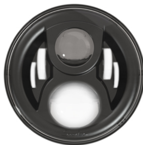
STANDARD HIGH BEAM